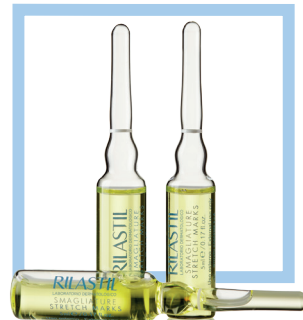
10 x 5 ml ampoules